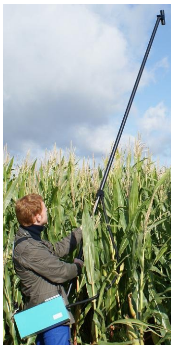
Fig. 2: In-situ measurements of maize