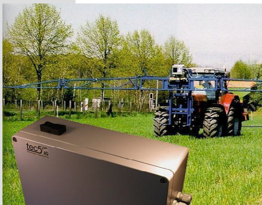
Fig. 1: tec5 AgroSpec

tec5 spectrometer systems have been used for years now - in well-known agricultural research institutes as well as in the already legendary Yara N-Sensor. Because of their high performance they become more and more wide-spread in this demanding area.