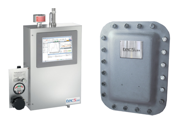
[Process Raman Spectrometer System]