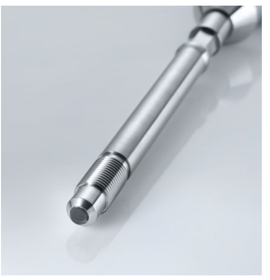
[Excalibur HD Extruder Probe]

The tec5USA UV-Vis Spectrometer has a modular design making it highly flexible and offering the possibility of customization to the particular needs of a given reaction. Essential for PAT, it has no moving parts making it a maintenance-free device, reducing operating costs and production losses associated with regular maintenance downtime.